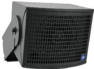
SGX41 with UBRKT/41 U-Bracket