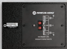
High Frequency Level Shading