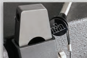
Safe & Simplified Hardware