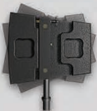
Multi-Angle Pole Socket