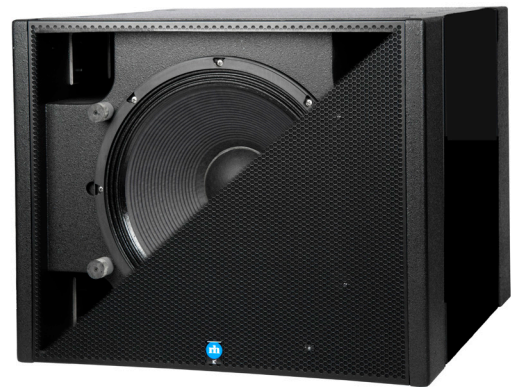
118S-FR IC 2 Subwoofer